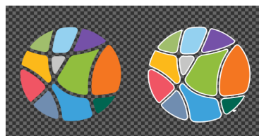
Any areas showing white will print white